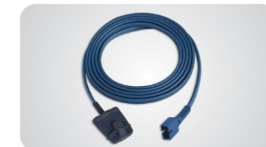
Adult soft sensor