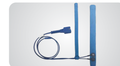
Neonate wrap sensor