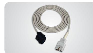
Pediatric soft sensor