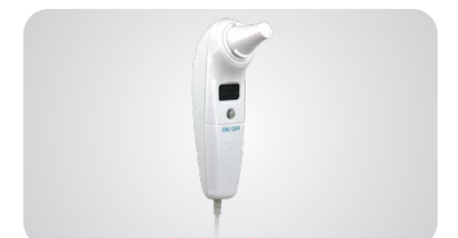
Infrared ear thermometer