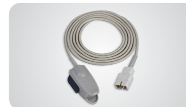
Adult clip sensor