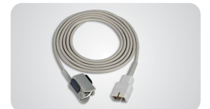
Pediatric clip sensor