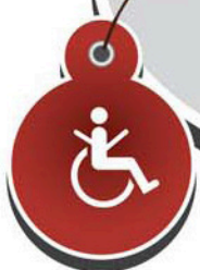
TopChair® stair climbing wheelchair

Advanced technology making life simpler for disabled people