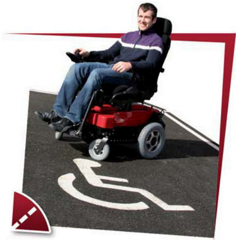
TopChair-S The stair climbing wheelchair