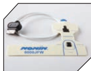
8000J-WO2 WristOx 2 – Flex (> 30 kg / > 66 lbs)