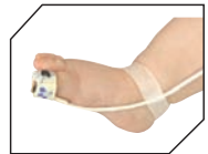
Infant Flex System (2–20 kg / 4–44 lbs)