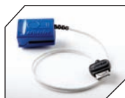
8000AA-WO2 WristOx 2 – Clip (> 30 kg / > 66 lbs)