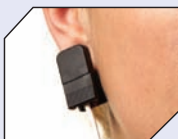
8000Q2 Ear Clip (> 40 kg / > 88 lbs)