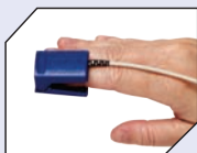
8000AA Adult Finger Clip (> 30 kg / > 66 lbs)