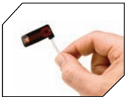
8008J Infant Flex Sensor