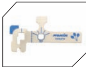
8008JFW Infant FlexiWrap®