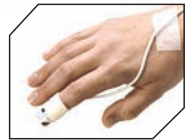
Adult Flex System (> 20 kg / > 44 lbs)