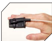
8000SM Medium Soft Sensor (10 mm–19 mm / 0.4–0.75 inches digit)