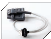
8000SL-WO2 WristOx 2 – Large Soft Sensor (12.5 mm–25.5 mm / 0.5–1.0 inches digit)