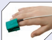
8000AP Pediatric Finger Clip (8–30 kg / 18–66 lbs)