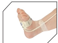
Neonate Flex System (< 2 kg / < 4 lbs)