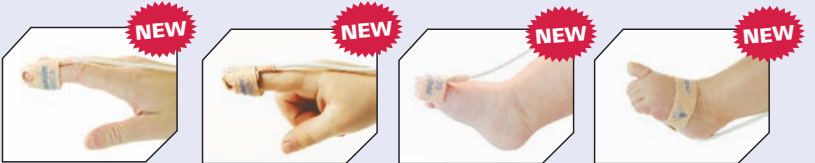
6000CA Adult Cloth Sensor (> 30 kg / > 66 lbs)