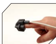
8000SS Small Soft Sensor (7.5 mm–12.5 mm / 0.3–0.5 inches digit)