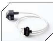
8000SS-WO2 WristOx 2 – Small Soft Sensor (7.5 mm–12.5 mm / 0.3–0.5 inches digit)