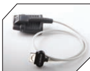
8000SM-WO2 WristOx 2 – Medium Soft Sensor (10 mm–19 mm / 0.4–0.75 inches digit)