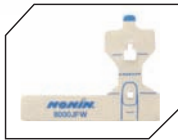
8000JFW Adult FlexiWrap®