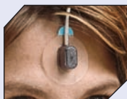
8000R Reflectance (> 30 kg / > 66 lbs)