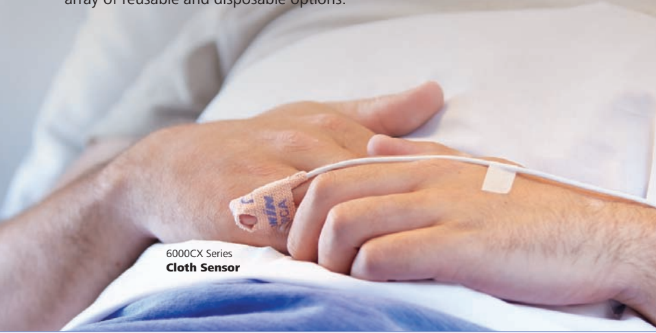
6000CX Series Cloth Sensor

Nonin's PureLight sensor technology boasts pure red and infrared LEDs to create unparalleled accuracy — even at critical SpO 2 levels. Choose from an array of reusable and disposable options.