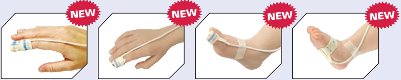
7000A Adult Flexi-Form® III (> 30 kg / > 66 lbs)