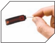
8000J Adult Flex Sensor