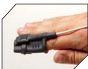
8000SL Large Soft Sensor (12.5 mm–25.5 mm / 0.5–1.0 inches digit)